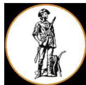
SAND SPRINGS SANDITES